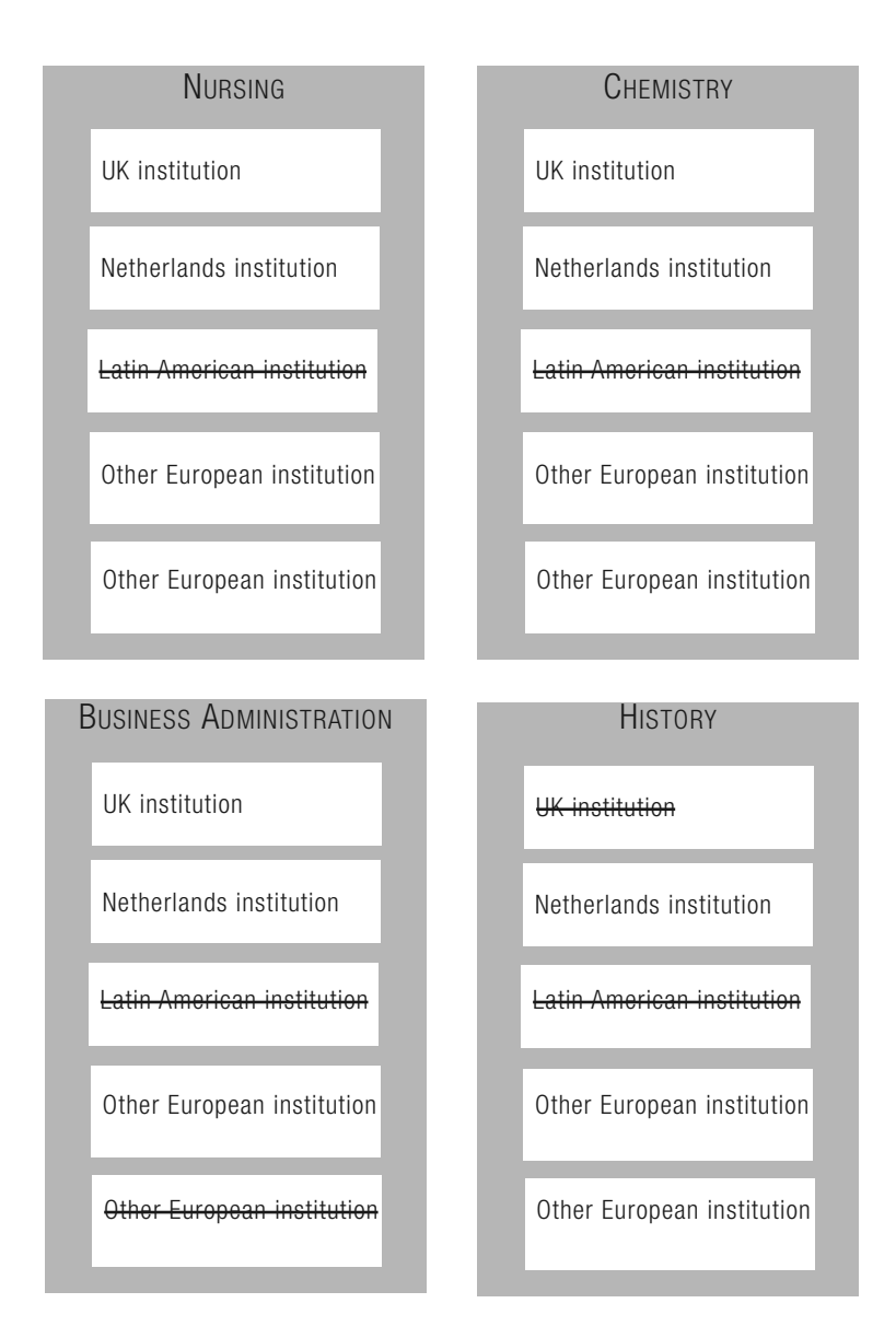
Figure 1: Overview of institutions from which documents were planned to be collected and actually received

Based on the information that was provided in the documents of the institutions, an evaluation of the study programmes and the value of the information for the purpose of credential evaluation were made. During the evaluation process, the following questions were asked: